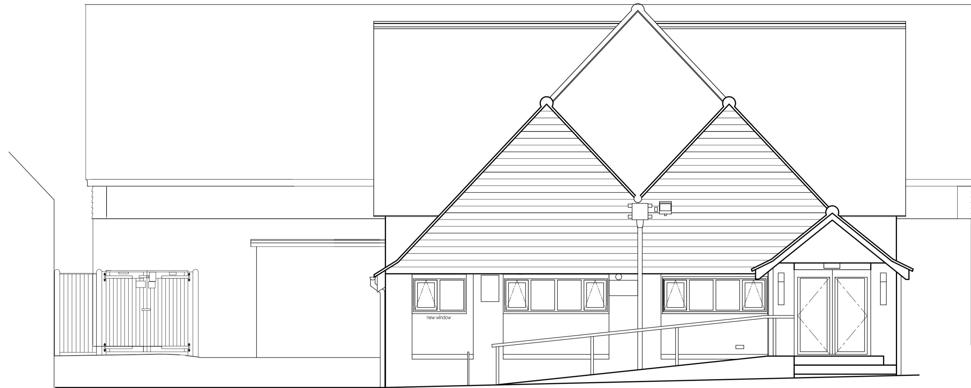
EAST ELEVATION - 1:50